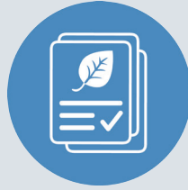
Network Development Plan and Environmental Report