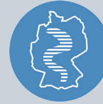
Federal Sectoral Planning