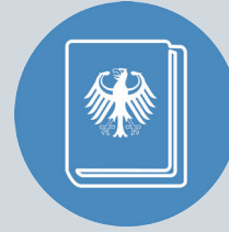
Federal Requirements Plan